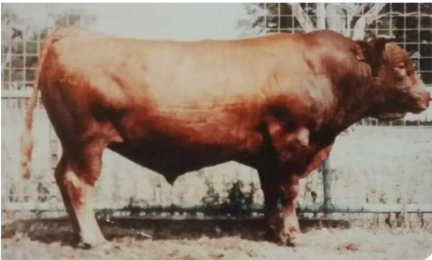
Judo, Sire of Lot 72

SHIGETAKARA H40 SAKAE RK23331 HIKARI JVP MS HOMARE J 31E RUESHAW JC MS UMEMARU 30 UKB MR SHIGEMARU/803 JVP MS HOMARE J 30E