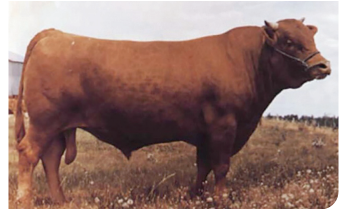
Rueshaw, Sire of Lots 32 & 33

FULLBLOOD TATTOO: ABNR 2004K BD: 2022-07-29 SEX: COW AWA: FB84982 RUEMEI H39 RUESHAW KIKUTAMA 14285 JUDO DCR MS JALKARI 53XF ET SOR MS BIG ALKARI #6 RYUEI H20 HARUMI H376 SOCHU H10 KIKUFUJI RK41627 SHIGETAKARA H40 SAKAE RK23331 HB BIG AL 502 UKB MS HIKARI HOMARE J30E(JVP)