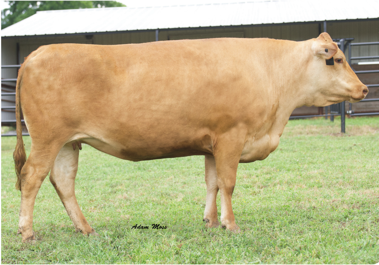
JC Kotsukari 280F ET, Dam of Lots 21 & 22