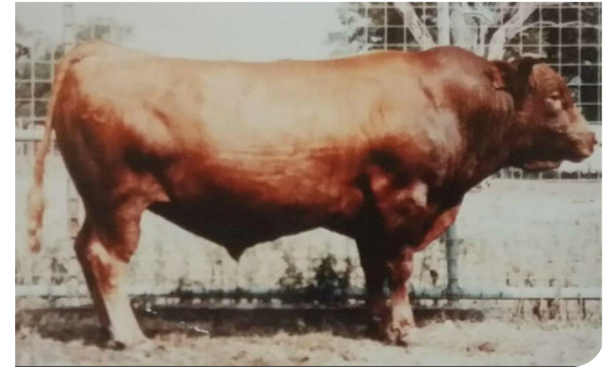
Judo, Sire of Lots 4A & 4B

JUDO SHIGETAKARA H40 SAKAE RK23331 HB BIG AL 502 DCW 118G ET JC MS RUESHAW 74 SHIGETAMA H11 TAKARA 3RD RK22765 MARUZONO F252 KAME RK4370 DAI 10 MITSUMARU AKIKO RUESHAW JC MS UMEMARU 30