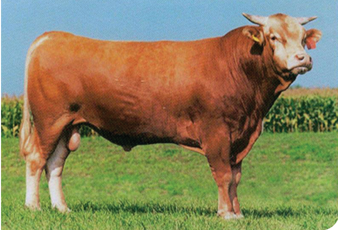
Shigamaru, Sire of Lots 92 & 93