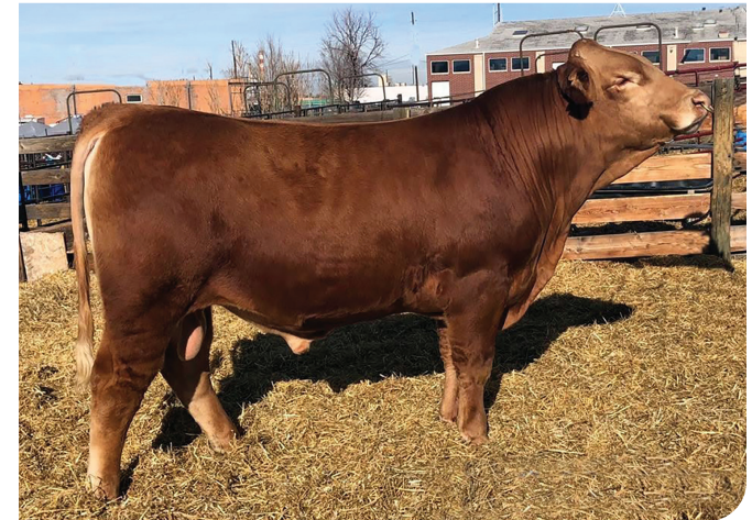
LAG 1105D ET, Sire of Lot 2C

FULLBLOOD TATTOO: GRJC 175M BD: 2024-11-04 SEX: COW AWA: FB127643 SHIGEMARU LAG 1105D ET WSI KAEDEMARU 2 RUESHAW JC MS RUESHAW 190 JC MS HIKARI 40 DAI 2 SHIGENAMI DAI YON AKIBARE 3357 TAMAMARU KAEDEMARU RUEMEI H39 KIKUTAMA 14285 HIKARI JVP MS HOMARE J 30E