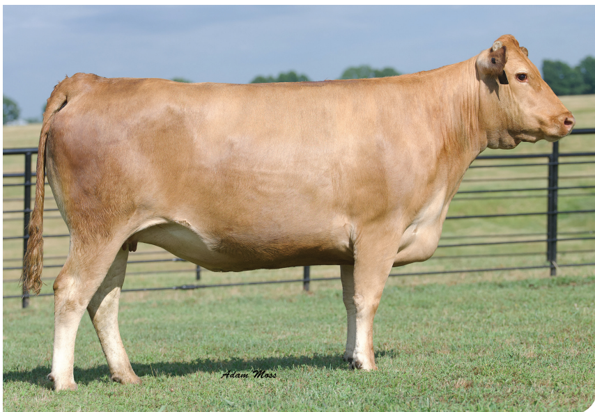
DCW Ms Rueshaw 17, Dam of Lots 38 & 39