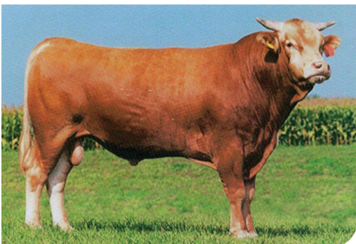
Shigemaru, Sire of Lot 32A

FULLBLOOD TATTOO: ABNR 2038K BD: 2022-09-14 SEX: COW AWA: FB86405 DAI GO TAMANAMI 96 TAMAMARU DAI 8 MARUNAMI J19461 JUDO DCR MS JALKARI 53XF ET SOR MS BIG ALKARI #6 TAMANAMI 70 FUJIMITSU 2030 DAI 3 MITSUMARU 30 DAI 7 MARUNAMI J14289 SHIGETAKARA H40 SAKAE RK23331 HB BIG AL 502 UKB MS HIKARI HOMARE J30E(JVP)