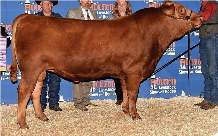
JC Rueshaw75, Sire of Lot 18