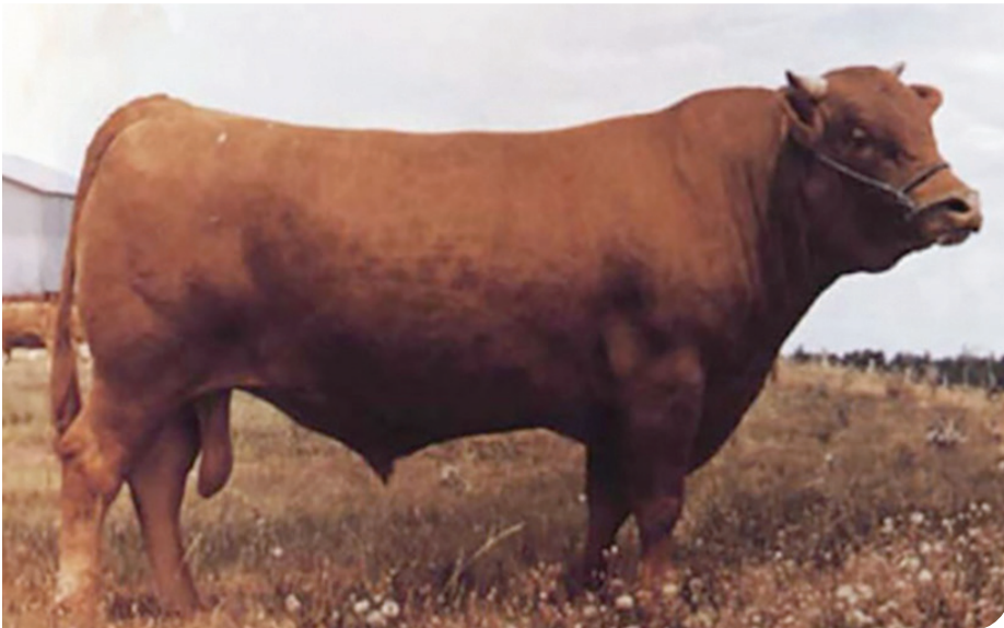
Rueshaw, Paternal grandsire of Lot 68C

HB BIG AL 502 UKB MS HIKARI HOMARE J30E(JVP) HIKARI JVP KUNISAKAE 124 WSI UMEMARU JVP KUNIASO J 6124F SOR KUNISAKI UKB MS HIKARI HOMARE J30E(JVP)