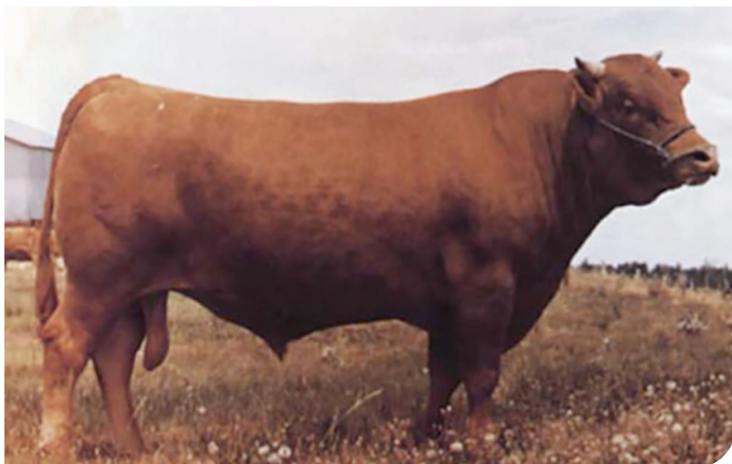
Rueshaw, Sire of Lots 1B, 1C, 1D & 1E

HIKARI DAI 10 MITSUMARU TWA KOTSUKARI KAZUTOMO 92958 AKIKO NAMIMARU HEART BRAND RED EMPEROR MITSUOKO B 9639 JC AKASAKAE HB BIG AL 502 JC MS UMEMARU 30 DAI 8 MARUNAMI J19461 WSI UMEMARU JVP KUNIASO J 6124F