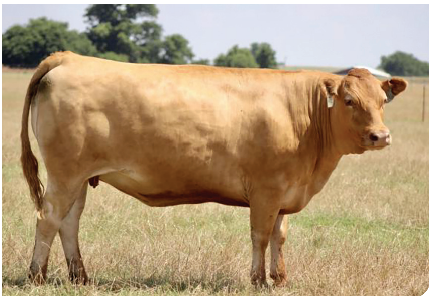
DCW Ms Rueshaw 48F ET, Dam of Lots 40 & 41