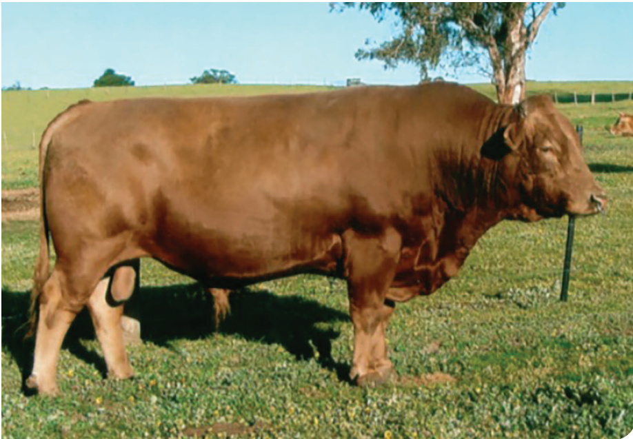
TWA Kotsukari, Sire of Lot 14