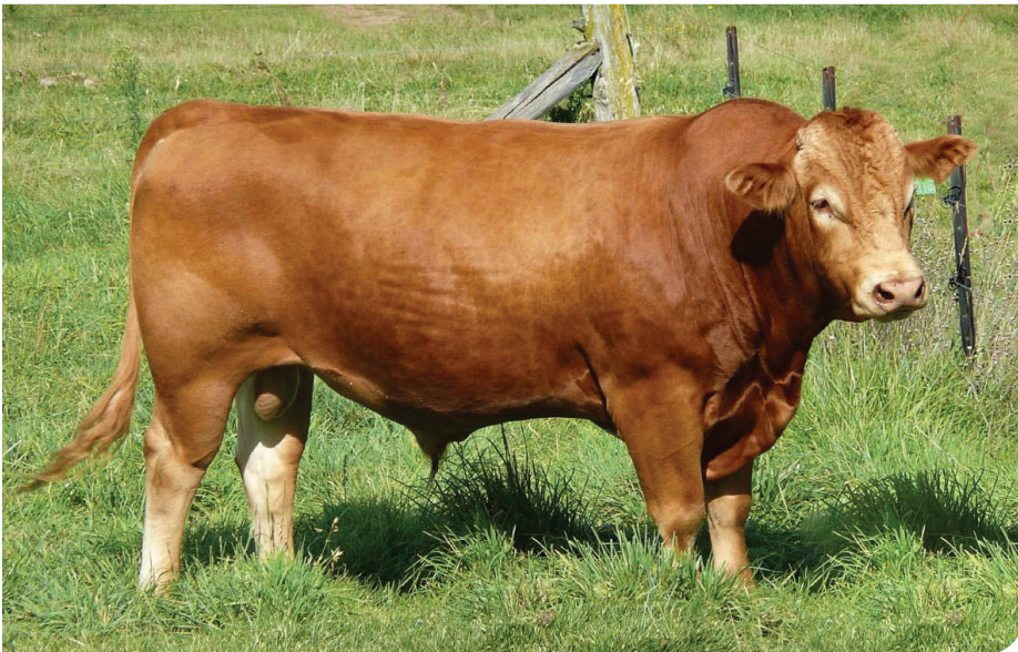
The Wright Wagyu Master Chef E146, Sire of Lot 19

RUEMEI H39 KIKUTAMA 14285 WSI UMEMARU JVP KUNIASO J 6124F DAI 10 MITSUMARU AKIKO GK4 RUESHAMARU JC EMPRESS 102