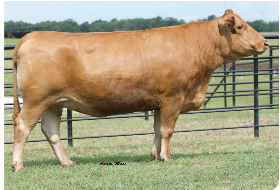
RMW Hoshiko D18, Dam of Lot 3