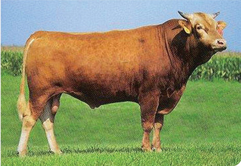
Tamamaru, Sire of Lots 75, 75A & 75B