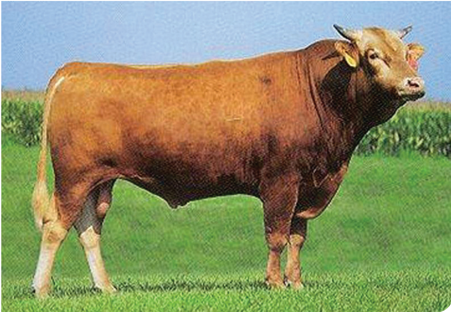
Tamamaru, Sire of Lots 40, 41, 42, 43, 44 & 45