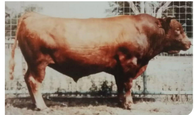
Judo, Sire of Lot 34

FULLBLOOD TATTOO: ABNR 2174K BD: 2022-10-19 SEX: BULL AWA: FB87408 JUDO SHIGETAKARA H40 SAKAE RK23331 JUDO DCR MS JALKARI 53XF ET SOR MS BIG ALKARI #6 SHIGETAMA H11 TAKARA 3RD RK22765 MARUZONO F252 KAME RK4370 SHIGETAKARA H40 SAKAE RK23331 HB BIG AL 502 UKB MS HIKARI HOMARE J30E(JVP)