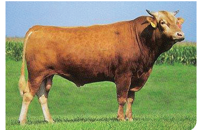
Tamamaru, Sire of Lots 12E, 12F & 12G

TAMANAMI 70 FUJIMITSU 2030 DAI 3 MITSUMARU 30 DAI 7 MARUNAMI J14289 DAI 2 SHIGENAMI DAI YON AKIBARE 3357 HIKARI JVP MS HOMARE J 30E