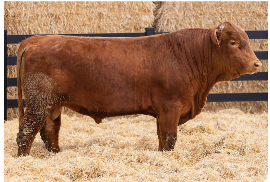
ABNR 1416K ET, Sire of Lot 73A