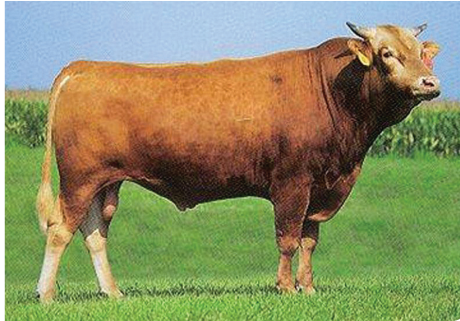
Tamamaru, sire of Lot 84