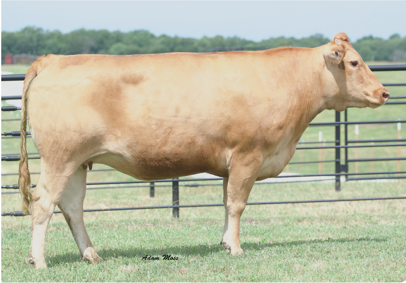
DCW Ms Rueshaw 14, Dam of Lots 10 & 11