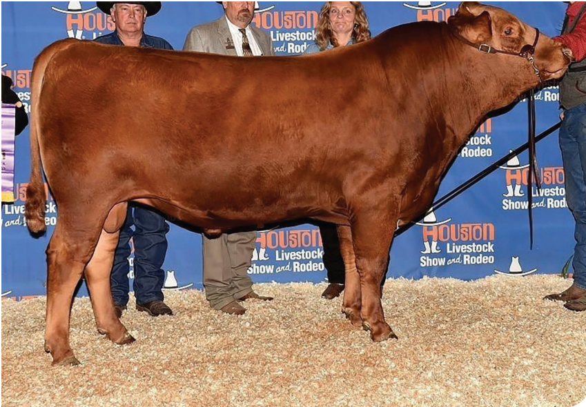
JC Rueshaw75, Sire of Lot 71