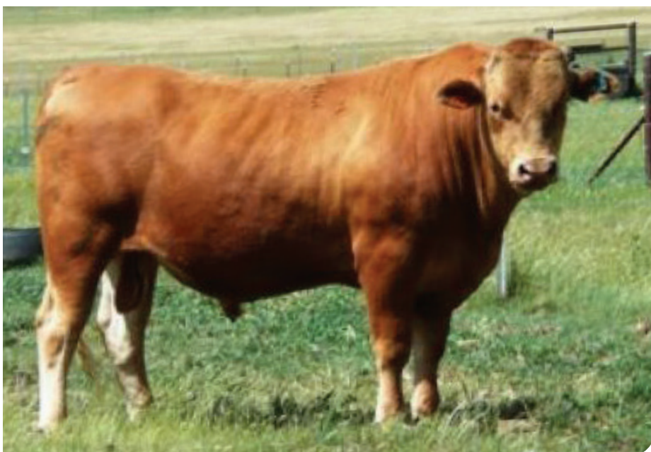
Kalanga Red Star, Sire of Lots 12A, 12B & 12C