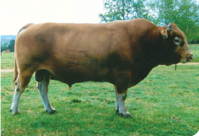
Ashwood Park Virile, Sire of Lots 5A & 9