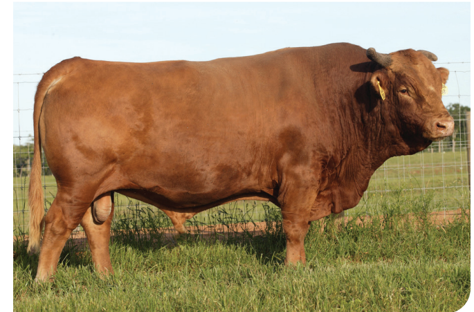
HB Big Al 502, Sire of Lot 70

FULLBLOOD TATTOO: ABNR 1267K BD: 2022-02-18 SEX: COW AWA: FB79562 DAI 10 MITSUMARU DAI 2 MITSUMARU HB BIG AL 502 GODAI AKIKO NAMIMARU mitsuko B 9639 BALD RIDGE HENSHIN KALANGA KAJIKARI B0125 CHR MS SHIGEMARU 693D KALANGA STARMIKO B218 BALD RIDGE HOMARE BLUE KALANGA SHIGEMARU B0579 HIDDEN VALE OHV45